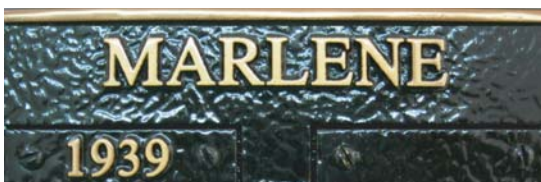
Codes Q7N, Q3Y, Q3Z: Includes top border