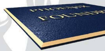
Plain Bevel Edge (available in any plaque size) (up to 1/4" depth) (available with painted or polished bevel)