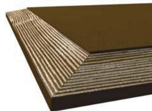
Wood Edge (set plaque sizes only)

Other options include Plain Cut Edges (up to 1/4" depth), Straight Edges (19/32" depth) and Bevel Edges. We have two types of Bevel Edges: Plain Bevel and Elite Bevel. Plain Bevel Edges can be either painted or polished. Elite Bevel Edges are available in a painted finish only.