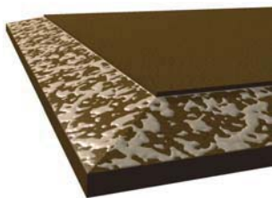
Rock Edge (set plaque sizes only)

The Rock and Wood Edges provide a sculptured look to the edge of your plaque. The width of these edges will vary with the size of marker required. Standard widths for these edges are 1" for markers 24" x 12" and less and 1.5" for markers over 24" x 12".