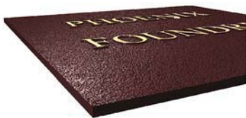
Plain Cut Edge (available in any plaque size) (up to 1/4" depth)

Other options include Plain Cut Edges (up to 1/4" depth), Straight Edges (19/32" depth) and Bevel Edges. We have two types of Bevel Edges: Plain Bevel and Elite Bevel. Plain Bevel Edges can be either painted or polished. Elite Bevel Edges are available in a painted finish only.