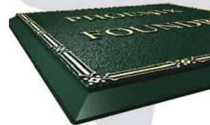
Elite Bevel Edge (set plaque sizes only) (available with painted bevel only)

Detailed specifications of our Edge options can be found at: www.phoenixfoundry.com/EdgeSpecs.shtml