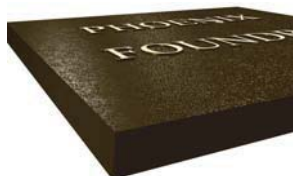
Straight Edge (set plaque sizes only) (19/32" depth)