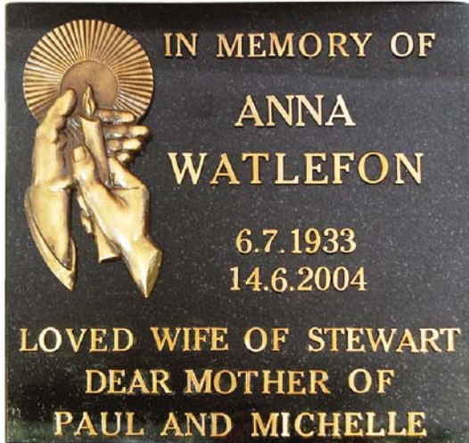
Glory Black Bronze Stone Plaque

Two beautiful and durable materials that have stood the test of time. Phoenix has created a new memorial plaque combining these materials. The union of polished bronze letters and motifs set on a polished granite base results in a visually appealing and elegant plaque that can be used in any cemetery situation.